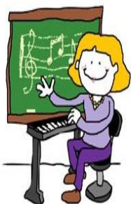
When I grow up I want to be... (a Music Teacher)

Check back soon on the NJSMA website for updates: NJSMA.com . Information is also posted regularly on the NJMEA Facebook page and the NJSMA Elementary Music Division Facebook